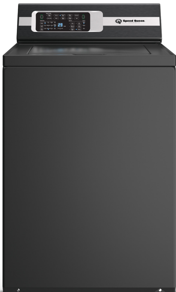
AWNE92 MB AWNE92SN305AB99